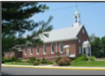
Saint Catherine of Siena 700 North Delsea Drive Clayton, NJ 08312

Learn a lesson from the fig tree. When its branch becomes tender and sprouts leaves, you know that summer is near.