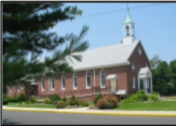
Saint Catherine of Siena 700 North Delsea Drive Clayton, NJ 08312