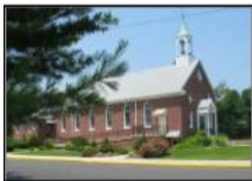
Saint Catherine of Siena 700 North Delsea Drive Clayton, NJ 08312