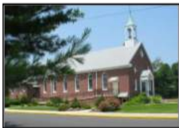
Saint Catherine of Siena 700 North Delsea Drive Clayton, NJ 08312